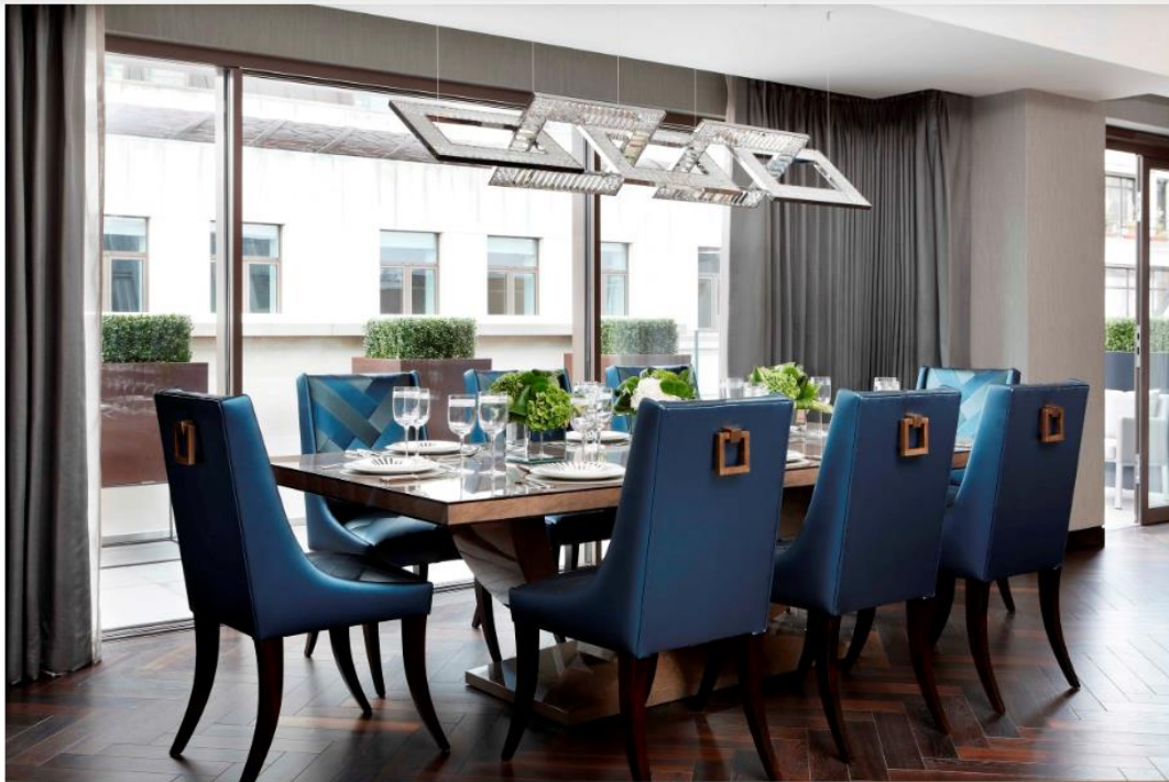
Brummell Penthouse Dining Space by Oliver Burns

There is also the spectacular seventh floor roof terrace – the crowning glory of the penthouse. It's spread across almost 1,000 sq ft, and is a real sanctuary in the heart of London. We worked closely with Dukelease and the architects to integrate the external plant area – originally on the terrace level – into the roof structure, creating a full-width roof terrace with near 360-degree panoramas across the city. With outdoor space extremely rare in such a prized location, we wanted to maximise its potential, as well as the views. We envisaged the terrace as an extension of the entertaining spaces: beneath the eight-seater dining table is a bespoke herringbone grille providing underfloor heating and mirroring the flooring in the living spaces below, while George Smith all-weather sofas and chairs, an outdoor television and a decadent kitchen with antique brown satinato granite worktops and backlit white onyx, ensure the roof terrace is the ultimate in luxury outdoor living.