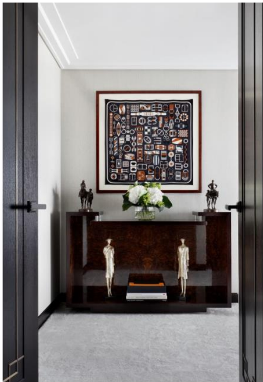
Brummell Penthouse Entrance to Master Suite by Oliver Burns

Our brief was to create a turnkey property that reflected the illustrious history and significance of the St James's area, with every element of the design drawing inspiration from 17th century arbiter of men's fashion, Beau Brummell. This concept was incorporated into the finest details, from the colour palette of navy blue and greys inspired by traditional tailoring through to the bespoke joinery and specially-crafted architectural lighting.