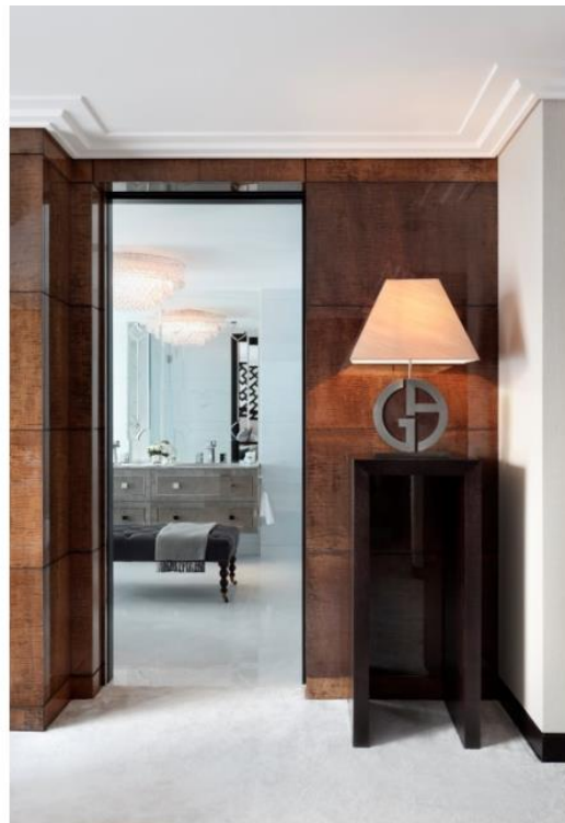
Brummell Penthouse Master Bedroom En-Suite by Oliver Burns