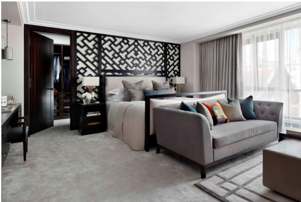
Brummell Penthouse Master Bedroom by Oliver Burns

We worked closely with both Dukelease and the architects, Brimelow McSweeney, from the very beginning to transform the building into an iconic residential address. This meant we were able to feed into the architectural design and ensure each space was maximised, from ceiling heights to the outside space which features on every level of the penthouse.