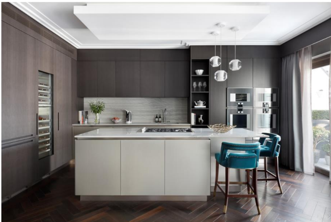
Brummell Penthouse Kitchen by Oliver Burns

There is also the spectacular seventh floor roof terrace – the crowning glory of the penthouse. It's spread across almost 1,000 sq ft, and is a real sanctuary in the heart of London. We worked closely with Dukelease and the architects to integrate the external plant area – originally on the terrace level – into the roof structure, creating a full-width roof terrace with near 360-degree panoramas across the city. With outdoor space extremely rare in such a prized location, we wanted to maximise its potential, as well as the views. We envisaged the terrace as an extension of the entertaining spaces: beneath the eight-seater dining table is a bespoke herringbone grille providing underfloor heating and mirroring the flooring in the living spaces below, while George Smith all-weather sofas and chairs, an outdoor television and a decadent kitchen with antique brown satinato granite worktops and backlit white onyx, ensure the roof terrace is the ultimate in luxury outdoor living.