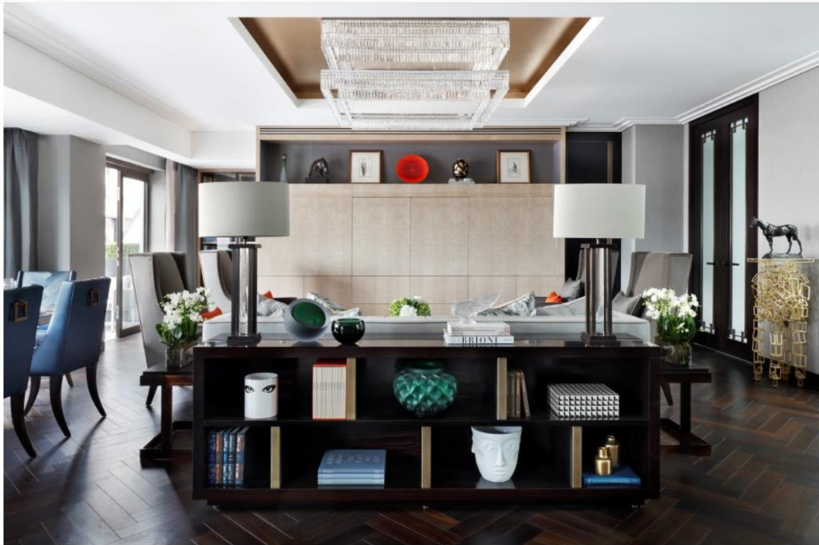
Brummell Penthouse Reception Space by Oliver Burns