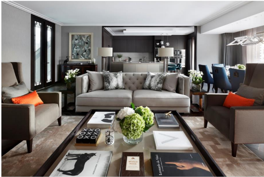
Brummell Penthouse Reception Space by Oliver Burns