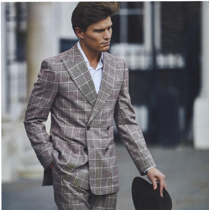
THIS PAGE: Hat by Lock & Co, £245/£310 lockhatters.co.uk ; Shirt by Turnbull & Asser, £195/£365 turnbullandasser.co.uk ; Suit by Richard James, £565/£717 richardjames.co.uk