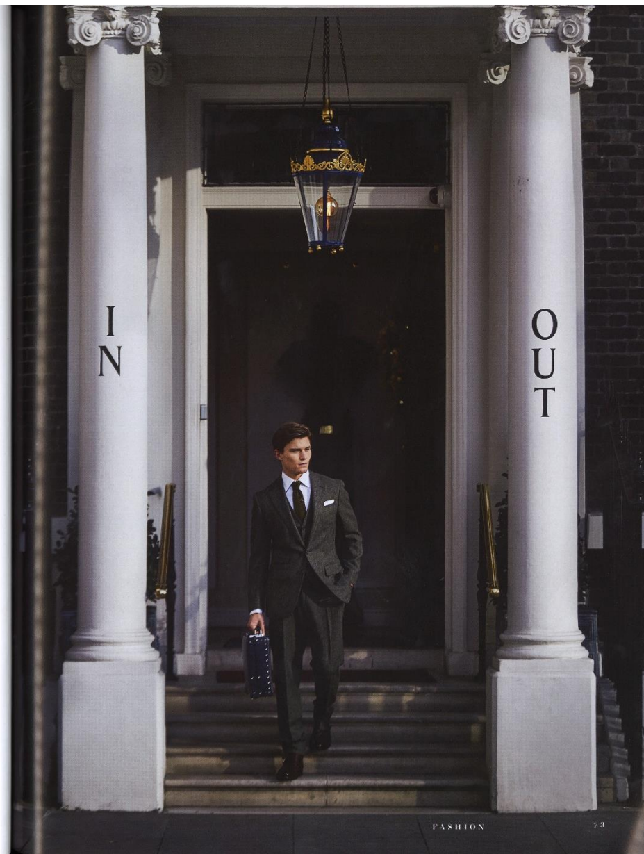
OPPOSITE PAGE: Suit by Thom Sweeney, £1,975/£2,500 thomsweeney.co.uk ; Shirt £133, Tie £75 both by Budd buddshirts.co.uk ; Boots by Crockett & Jones, £445/£785 crockettandjones.com ; Briefcase by Globe Trotter, £290/£1,660 globe-trotter.com