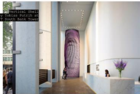
Vertical Shell by Tobias Putrih at CIT South Bank Tower

Selecting art should be an integral part of the overall design concept